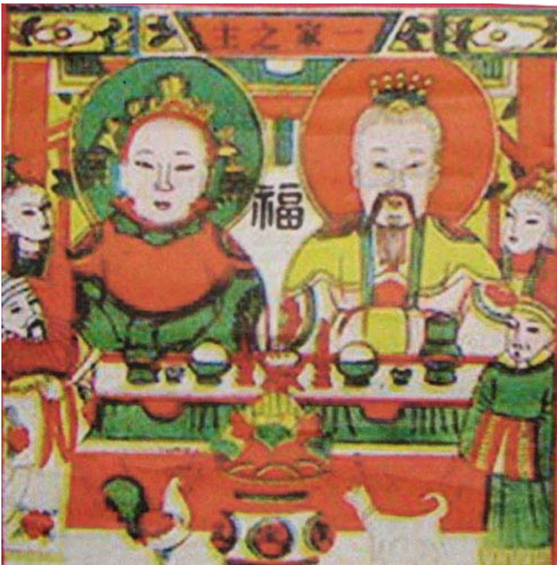
Kitchen God & his Wife

Làbā 臘八 is sweet. Làbā 臘八 is a hot porridge of grains, dried fruit and nuts.